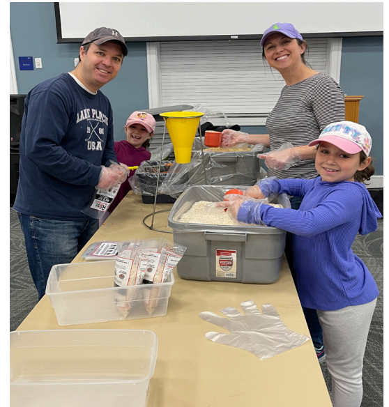
Held two Rise Against Hunger events packing 104,000 meals.