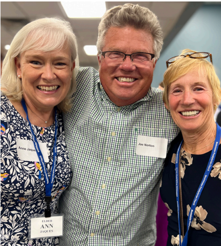
Many fellowship activities returned including celebrations for retiring & new staff and a September Celebration.