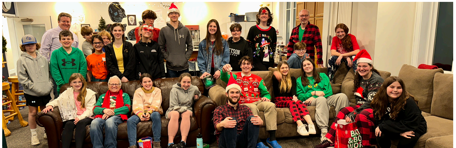
Youth Group's Christmas Party