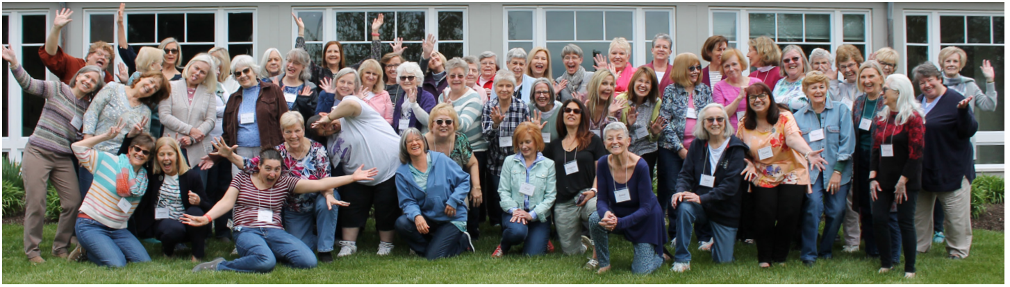
68 women attended our first Women's Retreat since 2019.