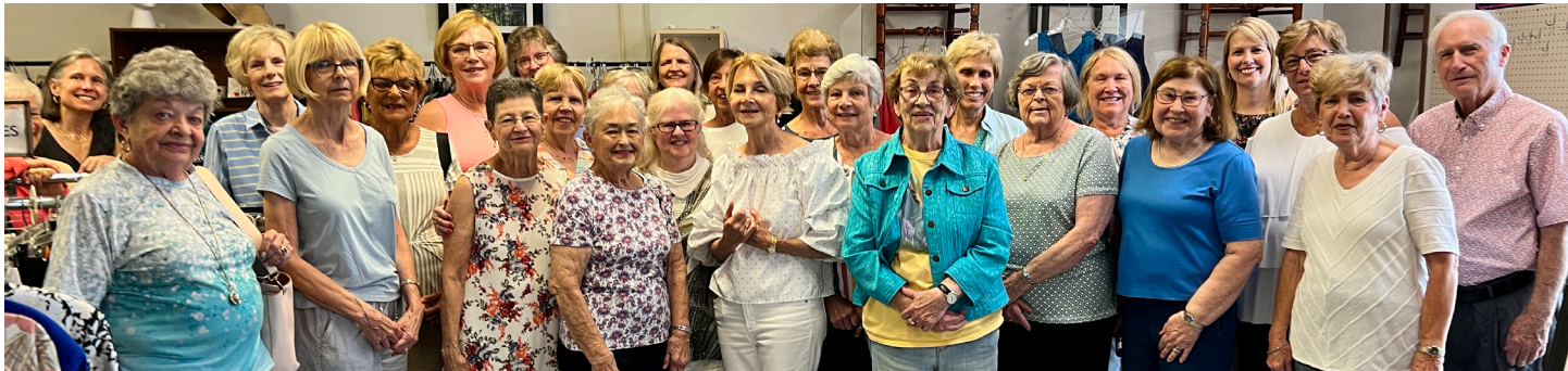
Thrift Shop volunteers gather for lunch before their 33rd season began in September.