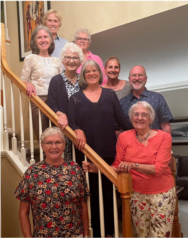
Stephen Ministers gather for fellowship in September