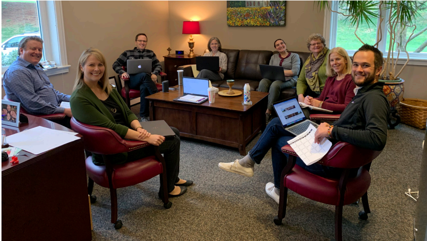
We welcomed many new staff this year. Our program staff and our Director of Communications meet in October.