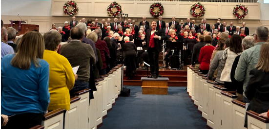
Christmas concert returns to our six concert schedule