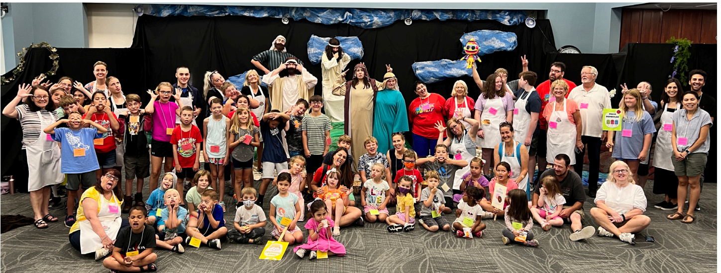
In-person Vacation Bible School returned in June.