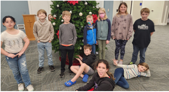
KidsJAM choir for 2-5th grade restarts in November