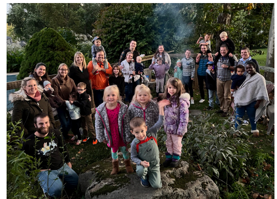
Young families gathered for fellowship in October