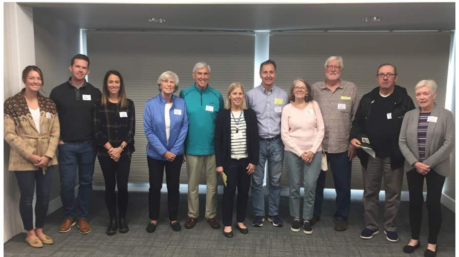
In October we held our first in-person new member class since 2020!