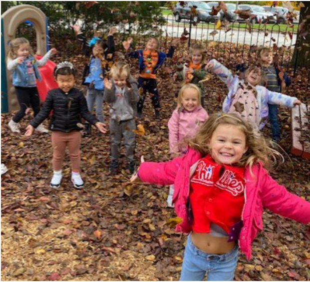
Pre-K 4 year old class enjoy recess