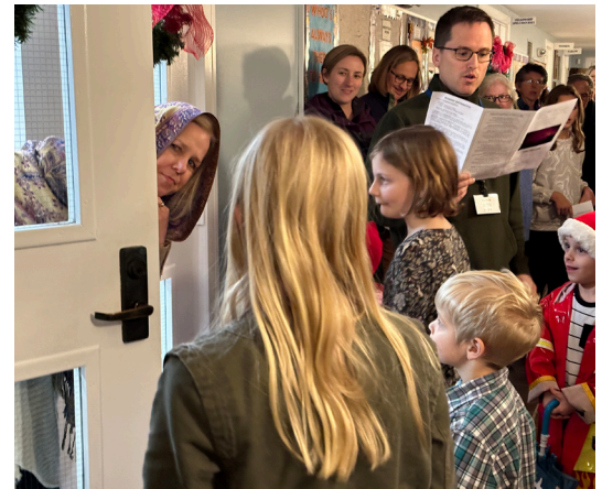
Children look for room in the inn at Las Posadas Vespers Service in December