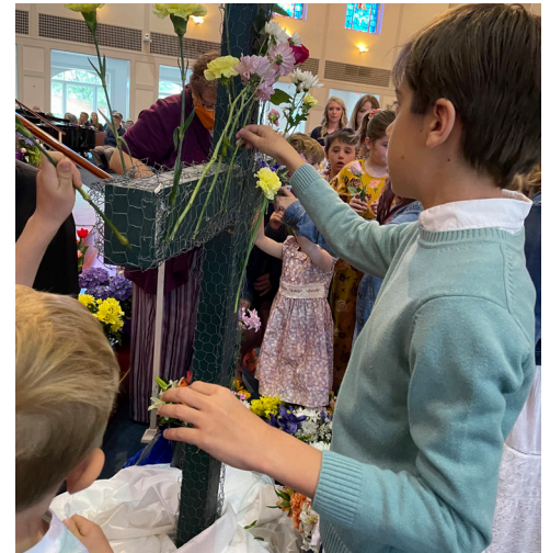
Easter Sunday was the first time since March 2020 that more people worshiped in person than online.