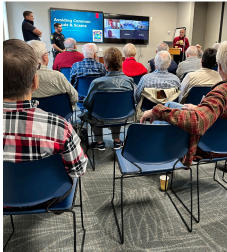
Many small groups successfully navigate hybrid gatherings.