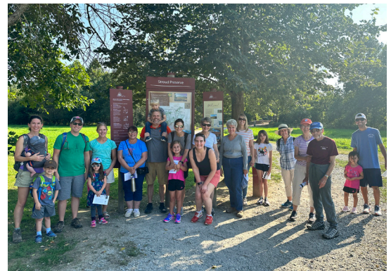
Prayer hike at Stroud Preserve on September 18.