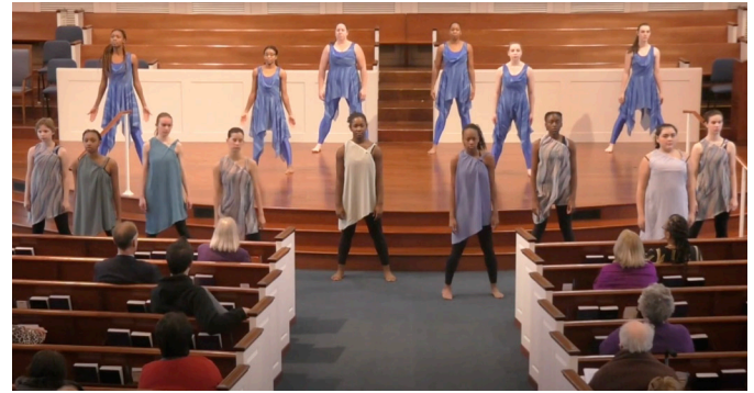
The West Chester Dance Works share a liturgical dance, Let Justice Flow, at the November Presbytery meeting. The Endowment Fund gave a $5,000 grant to West Chester Dance Works in 2022.

2023 Grant Deadlines: Feb. 3, April 7, June 2, Sept. 1 & Nov. 3