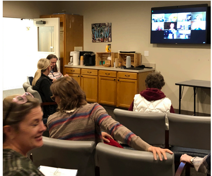
Our Deacons meet using our second Zoom Room in The Site installed thanks to our Memorial Fund.