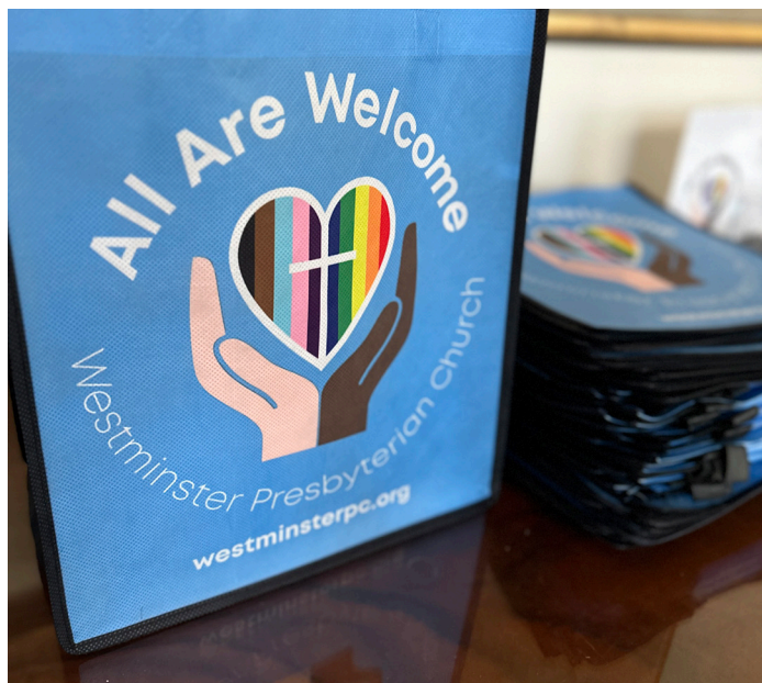
Pick up one of the All Are Welcome bags created by our inclusivity task force and outreach committee.

We especially proclaim this statement of welcome to those who have been excluded and/or told that they do not fully reflect the image of God. If you are looking for a place to share in God's great love and affirm that all people are God's children, we invite you to join us in our faith journey toward greater love, respect and understanding of one another.