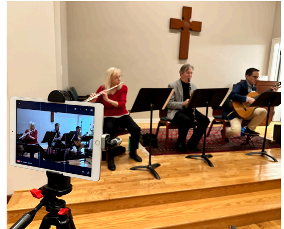
December 4 was our first live stream Taizé Service in the Chapel.