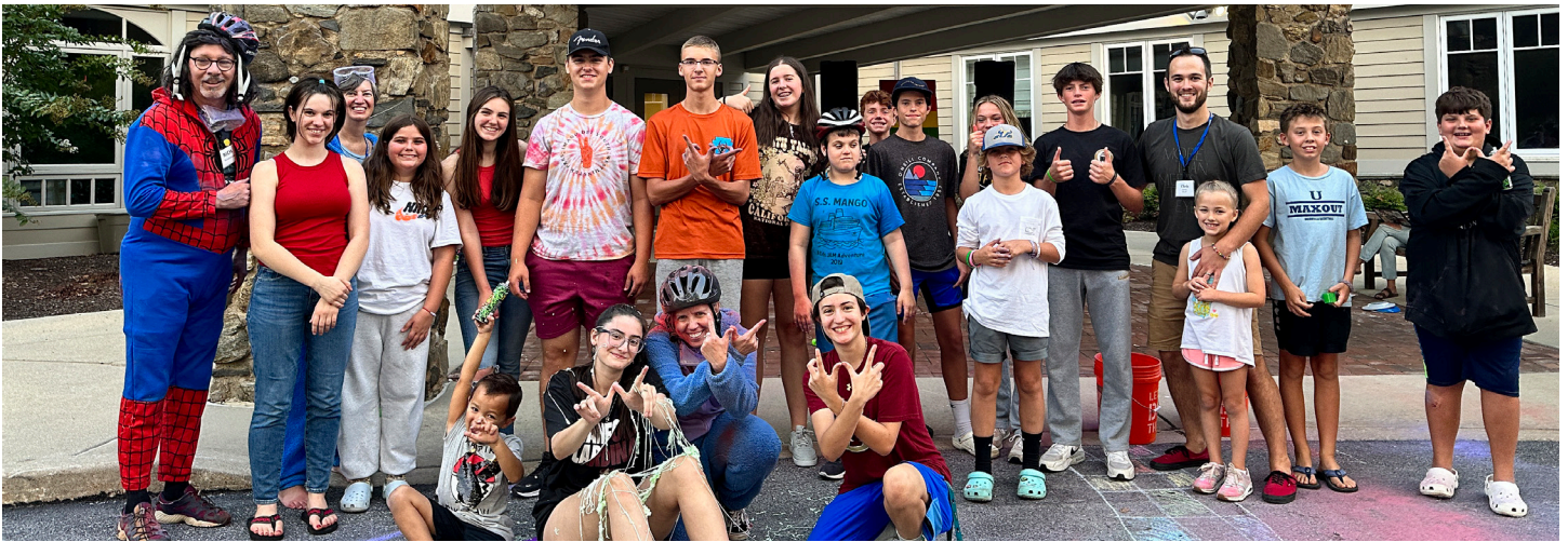
Youth Group's kickoff in September