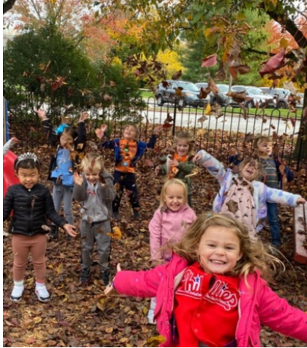
Fall was so much fun!

"Every good and perfect gift is from above"