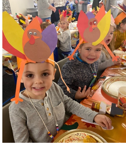
Thanksgiving Feast Day!