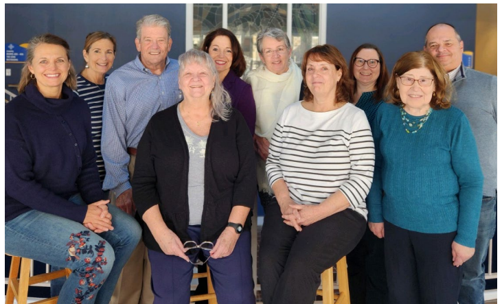
Our new Stephen Ministers during their six month training