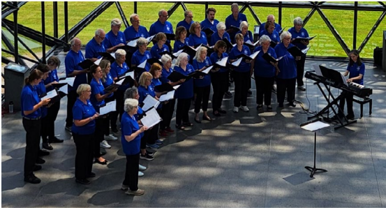
Chancel Choir sing at JFK's Presidential Library