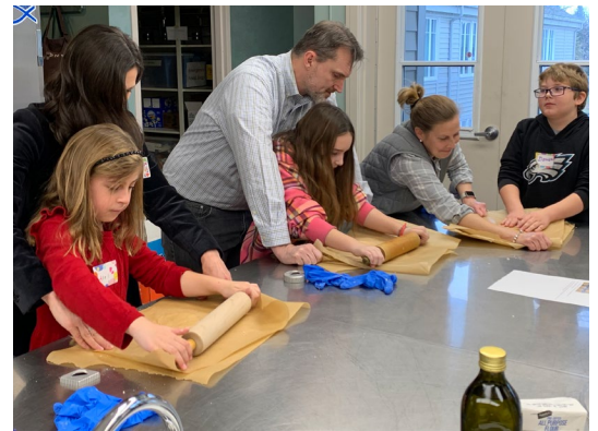
Children prepare communion bread at our communion workshop.