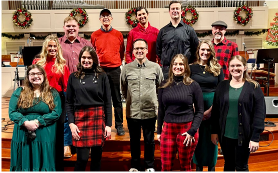
Our Worship Collective before their Christmas concert