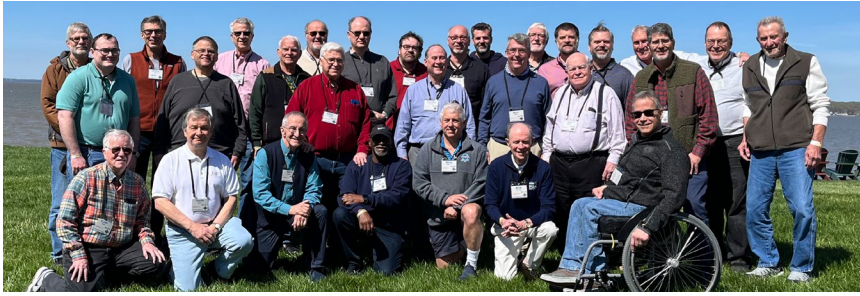
39 men attended our men's retreat.