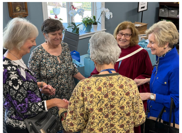
Deacons pray before departing to serve extended communion