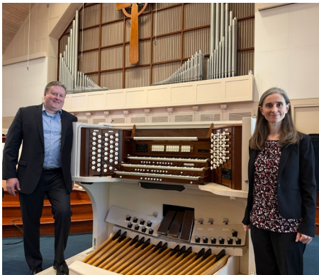
Celebrated the 50 th anniversary of our organ with a concert.