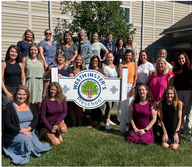
Preschool teachers and aids gather around their new outdoor sign before the start of the 2024-2025 school year.