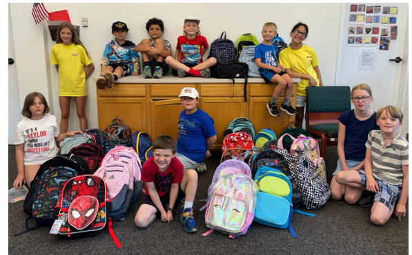
During Camp SPARK, these campers packed 30 backpacks for children with The Bridge Academy in Coatesville.