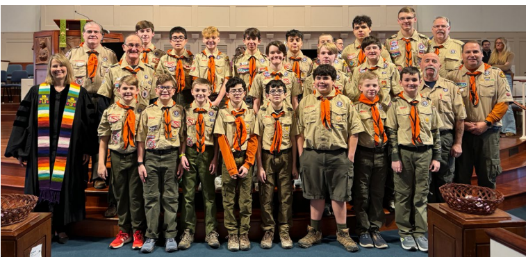
Troop 93 on Boy Scout Sunday