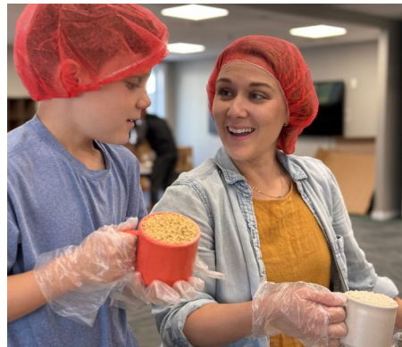
Over 300 people packed almost 100,000 meals for Rise Against Hunger in 2024.