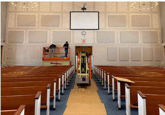
Acoustical treatment installed on the Sanctuary wall in November.