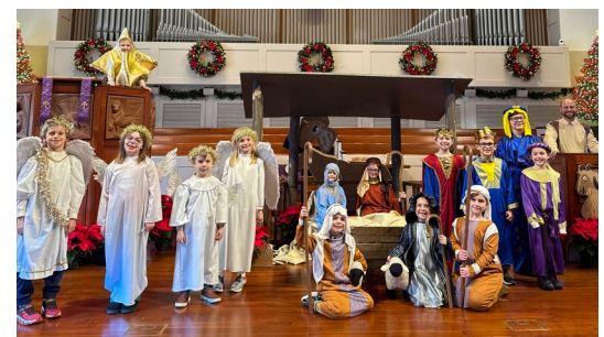
Children rehearse for the Christmas Eve service