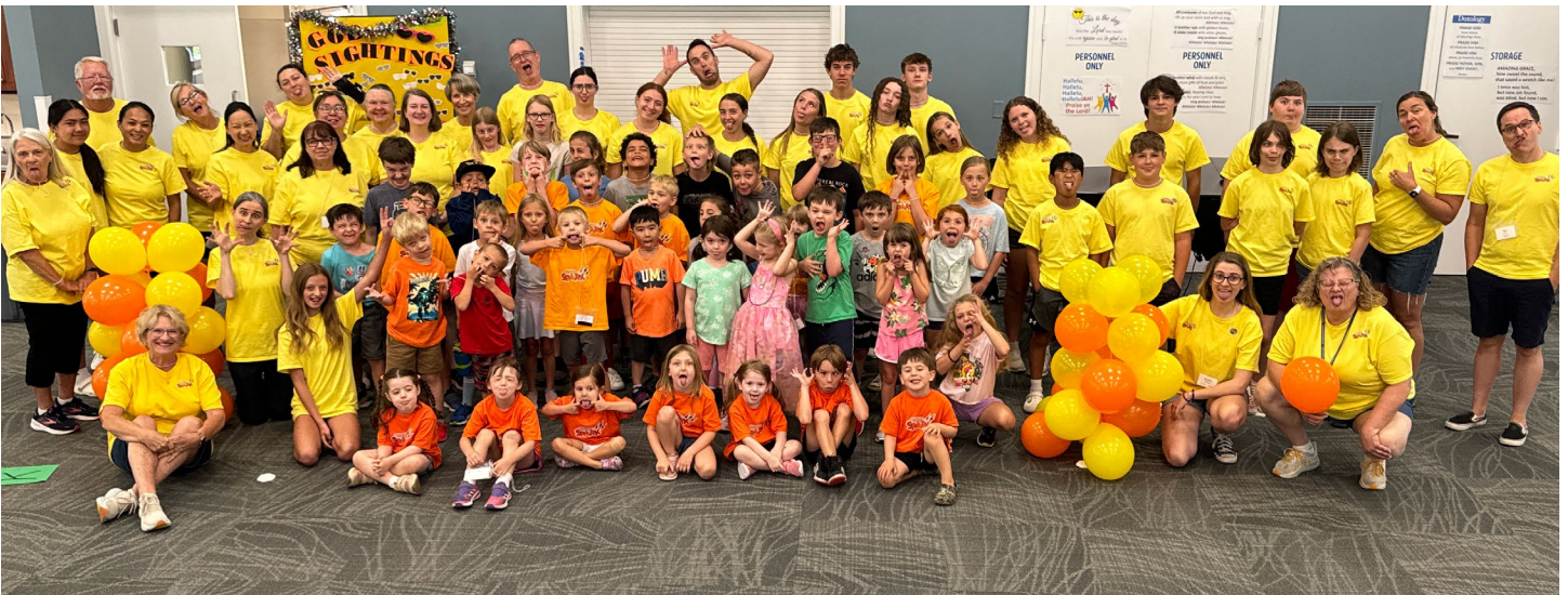
We launched Camp SPARK, a worship, arts and recreation camp for kids in June. The cover photo was also taken at Camp SPARK.