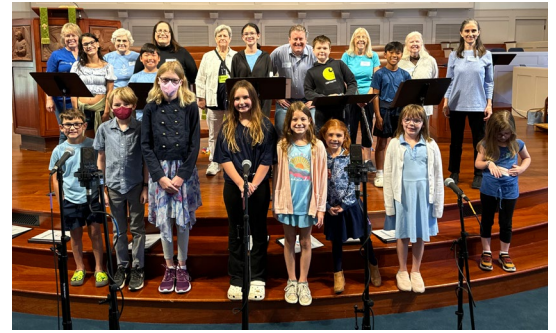
We introduce children to music at Westminster with our first music camp in August.