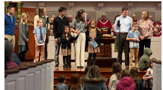
Third graders receive their Bibles