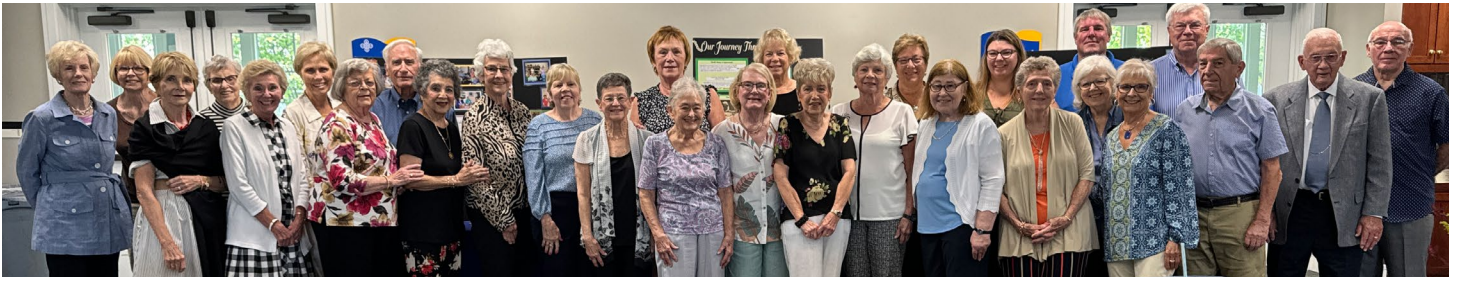
Thrift Shop Board volunteers at their 35th anniversary luncheon.