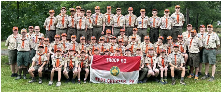
Troop 93 goes to summer camp