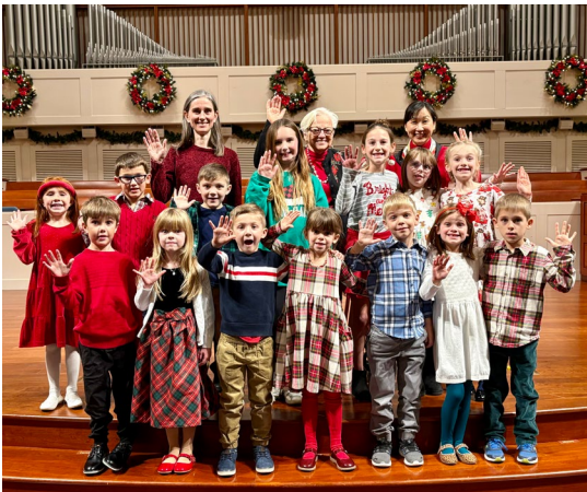
Our Cherub & Children's Choir at their Christmas concert