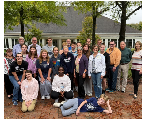
Confirmands began their journey in October with their mentors and the pastors.