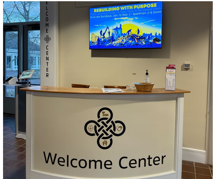
One of four digital signs around our building