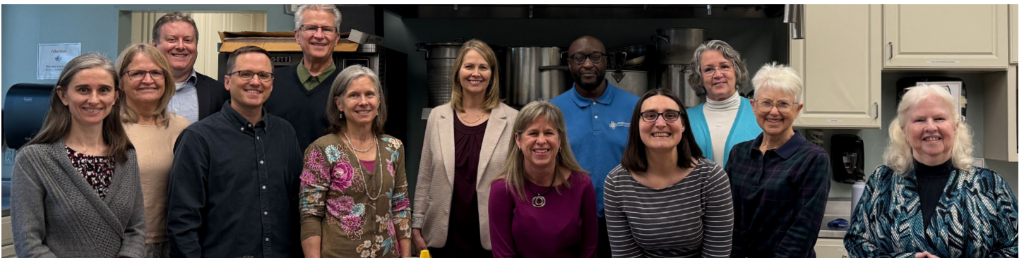
Staff enjoy a lunch from the personnel committee to celebrate staff appreciation month in October.