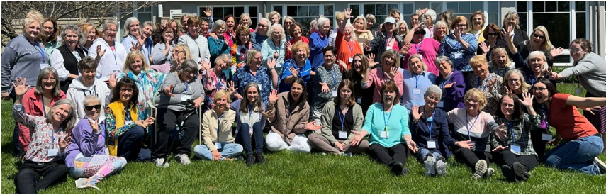
Over 80 women attended our women's retreat.