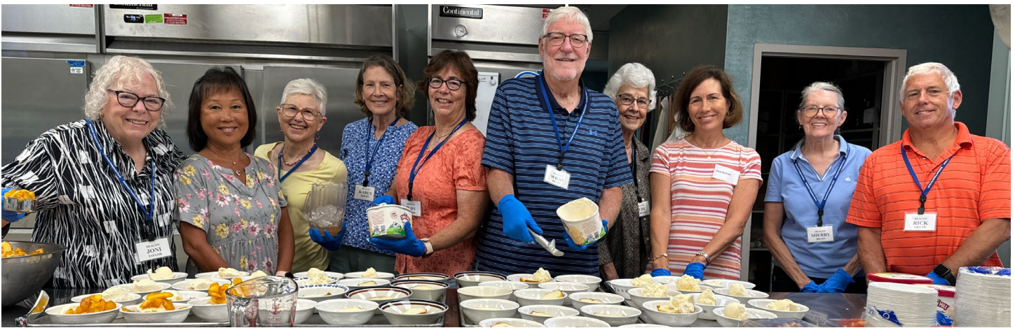
Deacons prepare for our annual peach festival