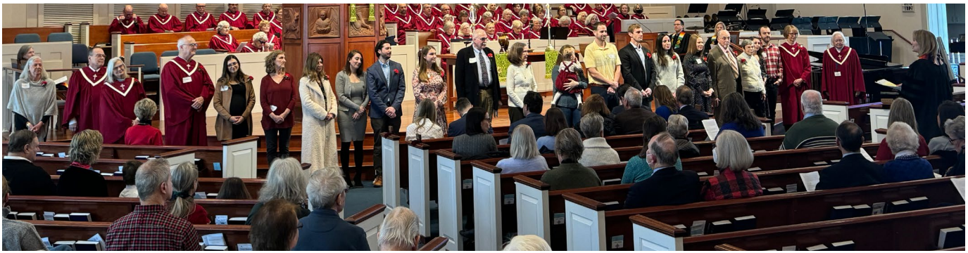
24 new members join in January