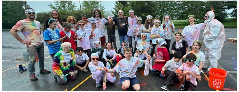
Youth after a fun Color War