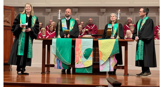
We introduced and dedicated new paraments.