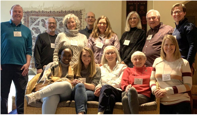
2024 Vision Team gather at their retreat in March